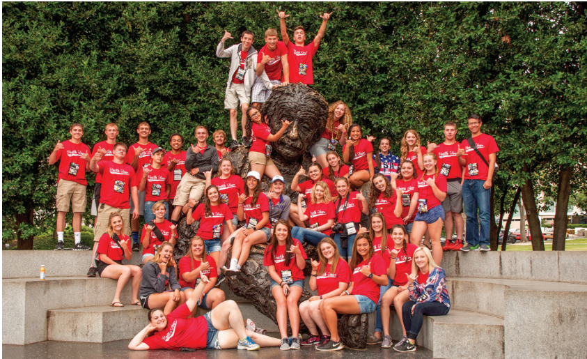
Each year, students from Kansas join more than 1,700 youth in Washington, D.C., to attend the Electric Cooperative Youth Tour. This year's Youth Tour is scheduled for June 8-15, 2017.